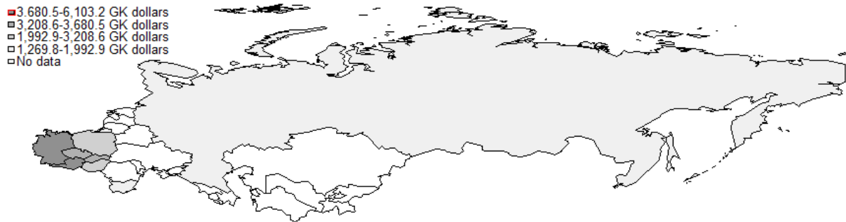
Map 2b: Physical capital per capita in 1990 (USSR=Russia, current borders) (1990 GK dollars)