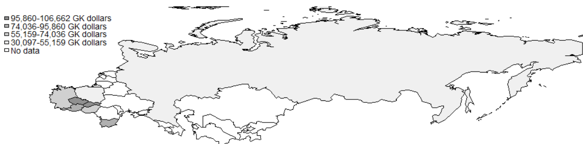
Map 3b: Income based human capital per capita in 1990 (1990 GK dollars)