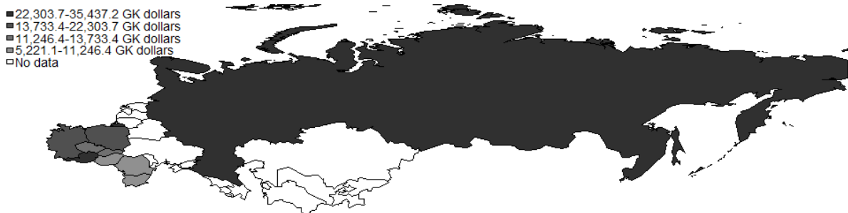
Map 3a: Income based human capital per capita in 1937 (USSR=Russia, current borders) (1990 GK dollars)